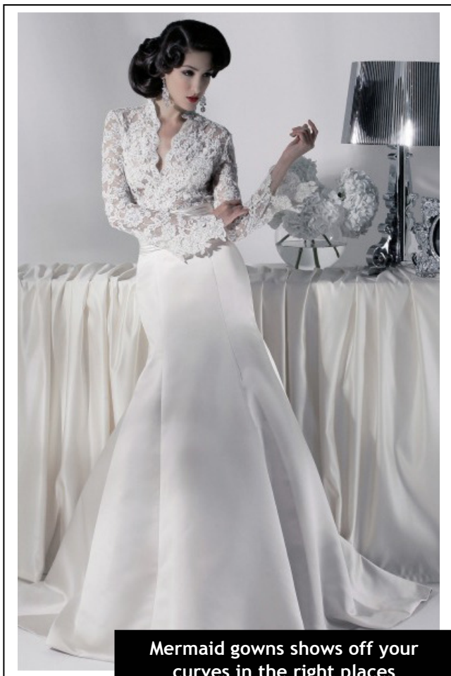
Mermaid gowns shows off your curves in the right places

Off-shoulder necklines - great for hourglass figure or pear shaped figure brides-to-be as it makes the shoulder looks broader. To be avoided if you are thin, no well-defined collar bones, have fuller arms or a broad shoulder.