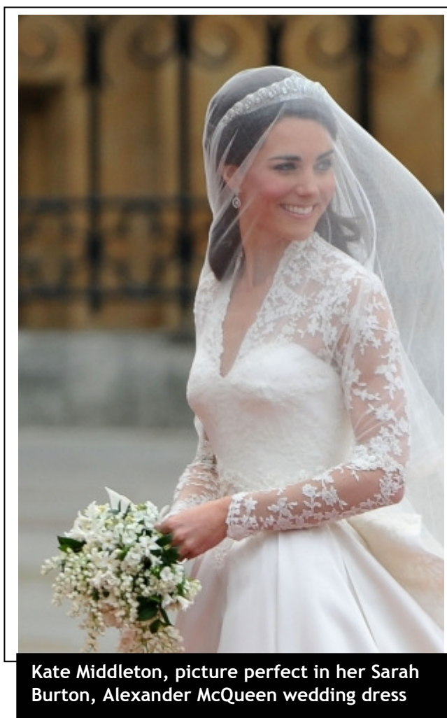
Kate Middleton, picture perfect in her Sarah Burton, Alexander McQueen wedding dress

If you are looking for that perfect wedding gown for your big day, let me help by sharing some tips so you can be picture perfect on your big day too.