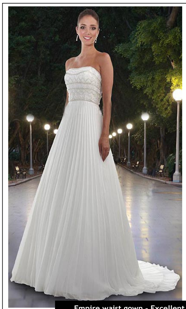
Empire waist gown - Excellent choice for petite brides