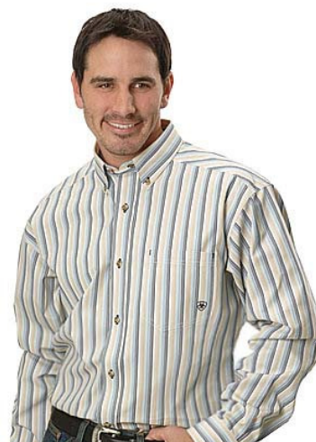
Business Casual – striped shirt with jeans

This means you can let your shirt show more of your personality. It’s a great opportunity to wear different fabrics, colours and styles like linen, short sleeves, prints or even Polo T-shirts. However, avoid any T-shirts without collars or shirts with offensive logos, images or texts. You may pair your top with corduroy casual trousers or dark jeans for a polished look.