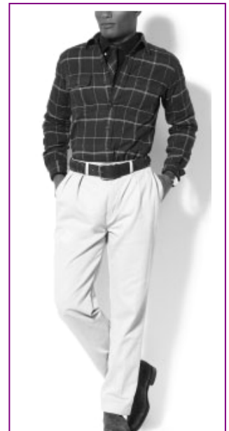
Business Casual for Men