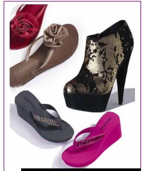
WRONG SHOES FOR Business Casual

Contact us at 81638169 or email to guin@imagemasteryint.com if you like to know how to create a successful personal image or to deck out in style!